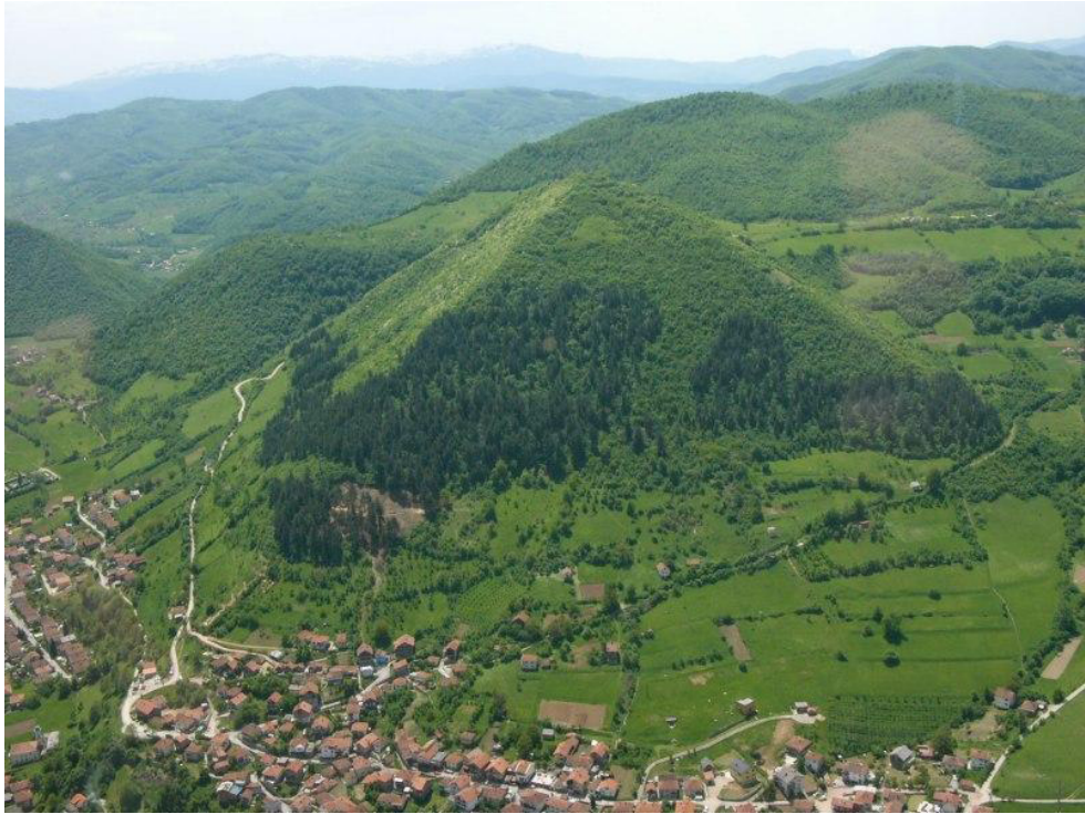
Figure 3. The Bosnian "Pyramid of the Sun".