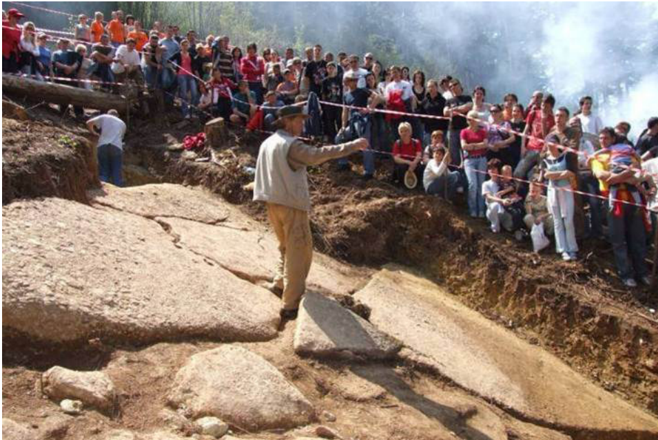
Figure 1. The Bosnian Valley of the Pyramids according to Semir Osmanagić.