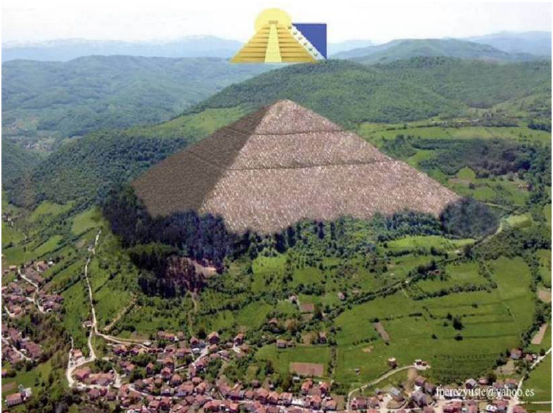
Figure 4. Hypothetical reconstruction of the Bosnian Pyramid of the Sun according to Semir Osmanagić (showing also the logo of the "Bosnian Pyramid of the Sun Foundation").

Nevertheless he responded to a few questions. Asked if he would agree that at the end of the day it doesn't really matter if the pyramids were real or not as the project has done so much for the people of Bosnia in terms of tourism, he disagreed: "I am a researcher; I am a scientist.... It is good that the country will benefit... but [this] is secondary." At the same time, although his work has been dismissed by practically all scientists around the world, he stated that he would not accept this as a final no to the hypothesis that the biggest and oldest pyramids of the world can be found in Bosnian Visoko (Figure 4). Having invested so much time and effort already, he was prepared to keep working with the project hoping that he would eventually be proven right. He also made something of a pity appeal to the audience for their support to allow him to continue working to test his hypothesis, obviously frustrated by the considerable opposition he faced by various authorities even within Bosnia and Hercegovina.