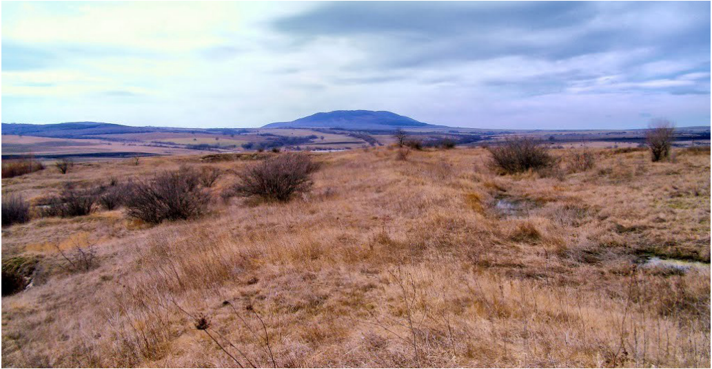
Figure 3: Erkesiya

and appropriate wielding of power. 10 Early medieval observers outside Bulgaria agreed with Omurtag's evaluation of the earthwork. The Erkesiya entered the historical record in the account of the Byzantine chronicler Skyltizes, writing shortly after 1050, as a basic feature of Thrace's landscape in the 960s. In the tenth century, al-Masudi also singled earthworks out as the most significant monument in Bulgaria south of the Danube. 11 In the generations after Omurtag, landscape change ignited the historical imagination of Bulgaria's neighbours. Following Omurtag's triumphal inscription, the ditch had developed a set of cultural and political associations.