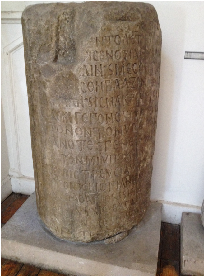
Figure 4: The pillar with the treaty inscription of AD 816 claiming khan Omurtag established the Erkesiya (after Curta 2019: 22, fig. 2.3, reproduced with permission)

have been, the Mercian king and Bulgar khan were also pragmatic men enmeshed in difficult, contested political situations for whom the momentary, immediate impact of digging the vast trenches was vitally important. Indeed, the spectacular nature of the process of excavation was central to the manifestation of rulers' power which landscape change achieved.