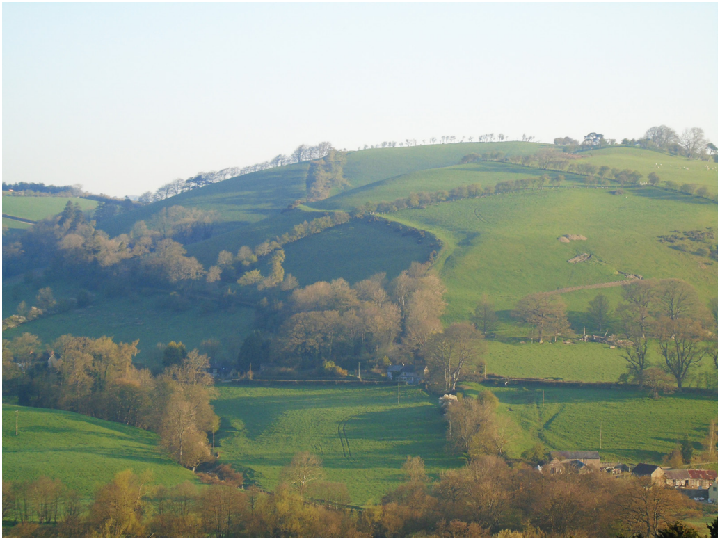
Figure 2: Offa's Dyke looking north across the Clun Valley, Shropshire

surviving Bulgarian texts refers to ditch digging by glorious rulers, which is suggestive of the centrality that activity enjoyed in Bulgarian culture. 8 The early eleventh-century Vision of Prophet Isaiah credits Asparuch, the khan who in 681 first settled the Bulgars in what would become Bulgaria, with the excavation of a giant ditch in the Danube delta. In the eighth century, long before the Christian missionaries brought their alphabet, some khans began to use Greek to inscribe accounts of their deeds on stone pillars and in other official texts. One such pillar, fragmentary but extant (Figure 4), by chance records the Bulgar side of a treaty made with Byzantium in 816, and seems to refer to the Erkesiya. The inscription claims khan Omurtag 'established' his southern border with Byzantium along a line corresponding closely to the one Bury's 'Fence' follows. 9 The pillar represents the ditch as a trophy of the khan, a sign of his prowess